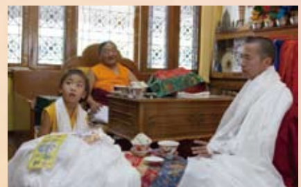
Student and teacher are offered khatas