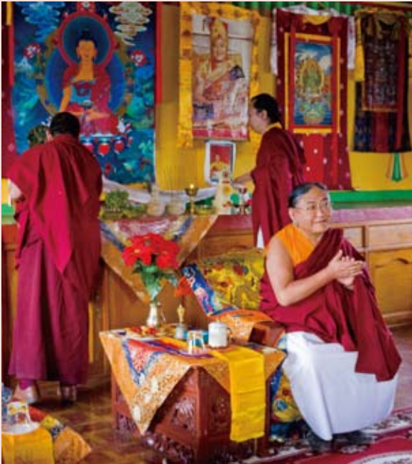
Sakya Orgyen Ling

And on the 15th of March, after over a week of basking in their Guru's light, the Pema Ts'al monks and the Pokhara Sakya community bid farewell to His Holiness the Sakya Trizin as He continued His Nepalese journey, this time to perform Dharma activities in Kathmandu and surroundings areas.