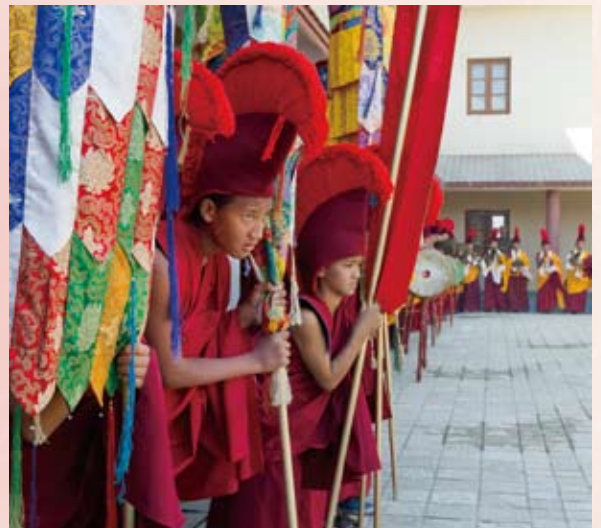
Greeting His Holiness at IBA in Kathmandu