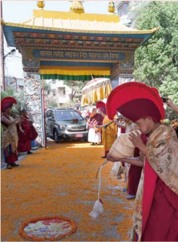
His Holiness arrives at Tharlam Monastery