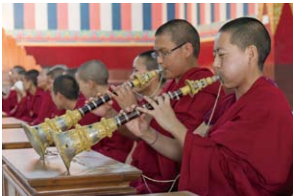
Early morning Tara puja

( dungchen ), all the ritual instruments are present, and several of the nuns excel at playing them.