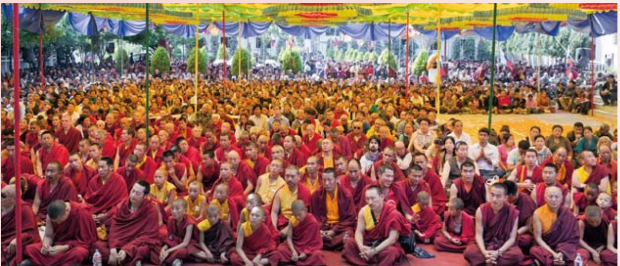
Tharlam Monastery monks receive an empowerment from His Holiness

His Holiness' last official visit was to Tharlam Monastery, where He imparted the Guru Rinpoche empowerment from the Apong Tertön Terma cycle and the Chenrezig empowerment.