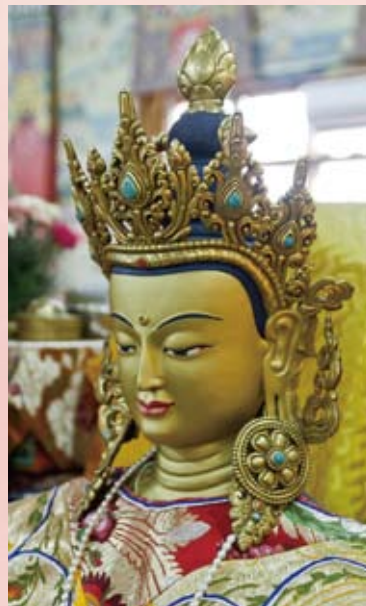
A gift of gratitude