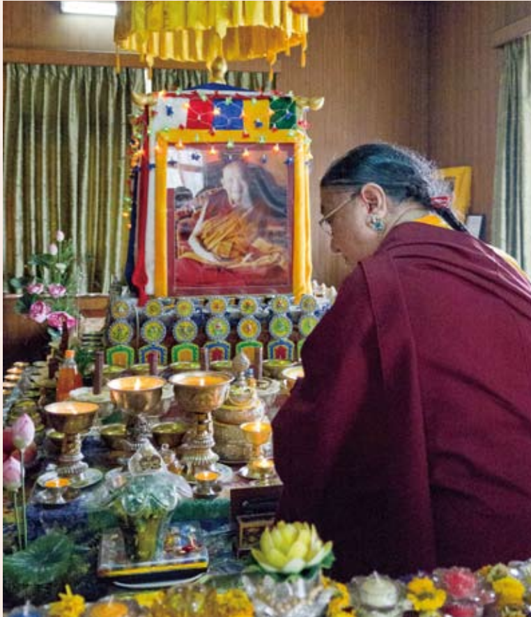
His Holiness pays His respects to Thruslig Rinpoche's kudung

His Holiness spent His first three days in Kathmandu at the Zarong Dho- ngag Thupten Choeling Thruslig Monastery, where He performed a Vajrakilaya puja before the kudung of the late Kyabje Trulshig Rinpoche.