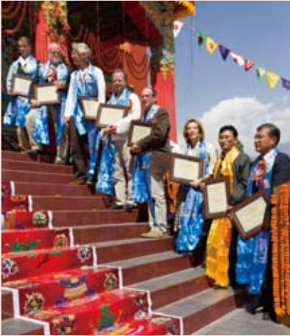
Sponsors and supporters of Pema Ts'al receive certificates of appreciation from His Holiness