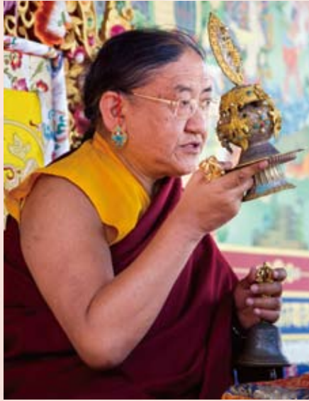
His Holiness giving the Phurba Torwang at Pema Ts'al