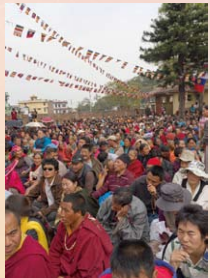
Empowerments at the Mustangi gompa in Swayambu