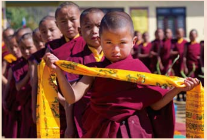
Pal Ewam Namgyal Monastic School