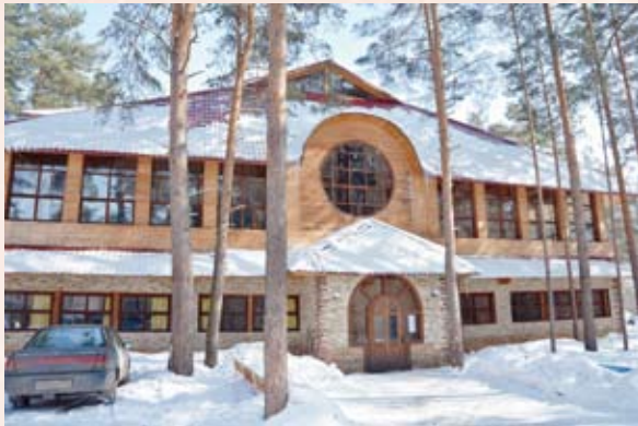
Gar Kunphenling Retreat Centre