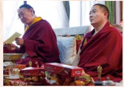
His Holiness and Shechen Rabjam Rinpoche performing the Vajrakilaya puja