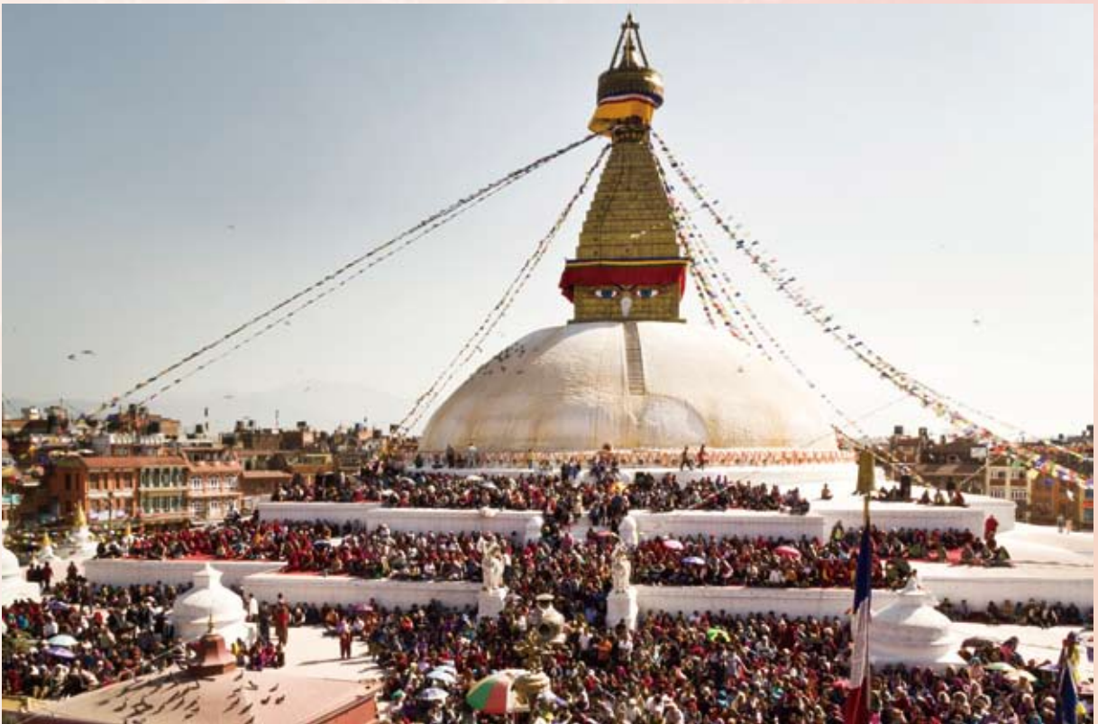
Boudanath stupa surrounded by devotees