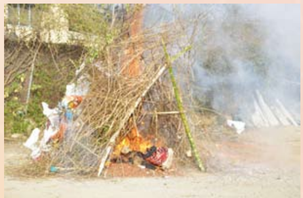
The effigies are thrown into the flames