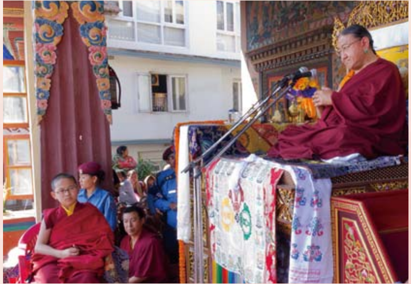
His Holiness performs the Tsewang at Gyang Guthi Gompa