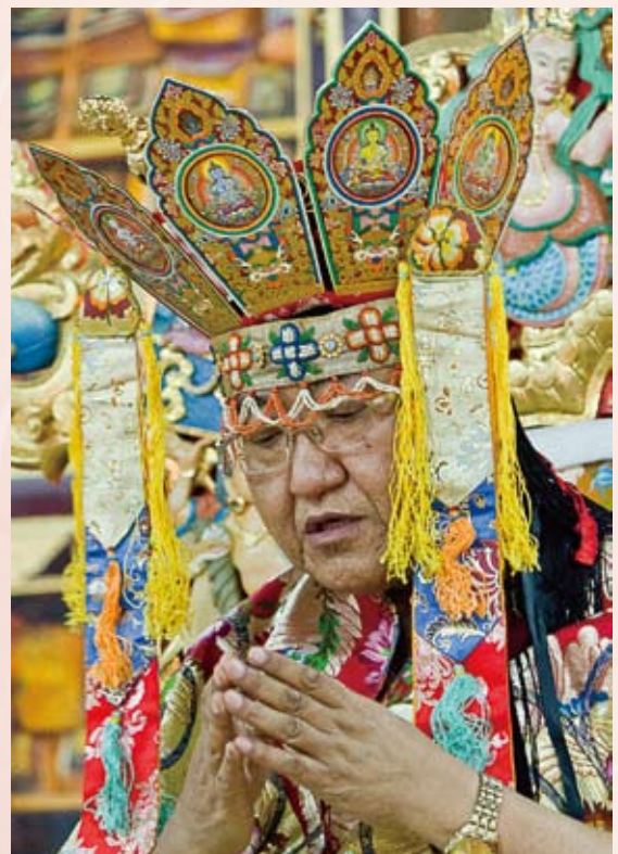
His Holiness bestowing the wangs

On the 5th of April began the third part of the Wangya Norbu Trengwa wangs at the Sakya Centre in Dehradun. This was the continuation of the cycle of initiations that, three years ago, Lama Thubten Zopa Rinpoche had requested His Holiness the Sakya Trizin to bestow to himself and to other