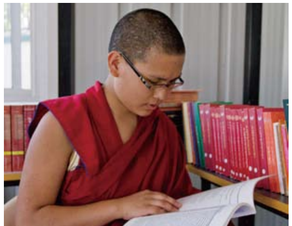
In-depth study of the texts