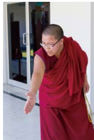
Daily debate session