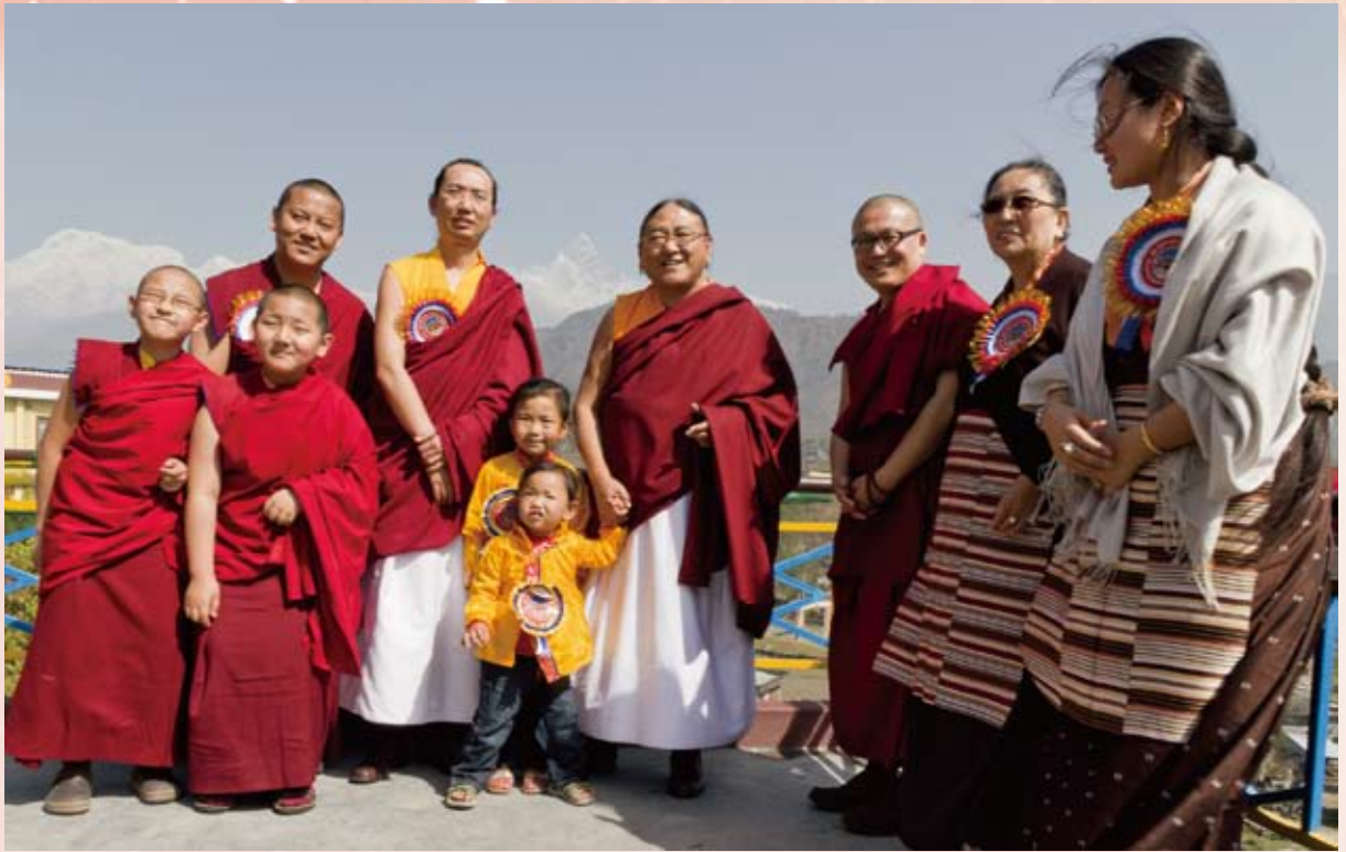
His Holiness and entourage on the roof of Pema Ts'al