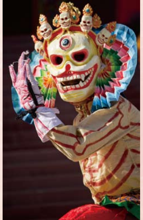
A lively and colourful cultural show was held for the inauguration

During His stay in Pokhara, His Holiness took the opportunity to visit several schools and institutions.