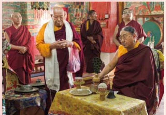
Wangduk Lama Gompa