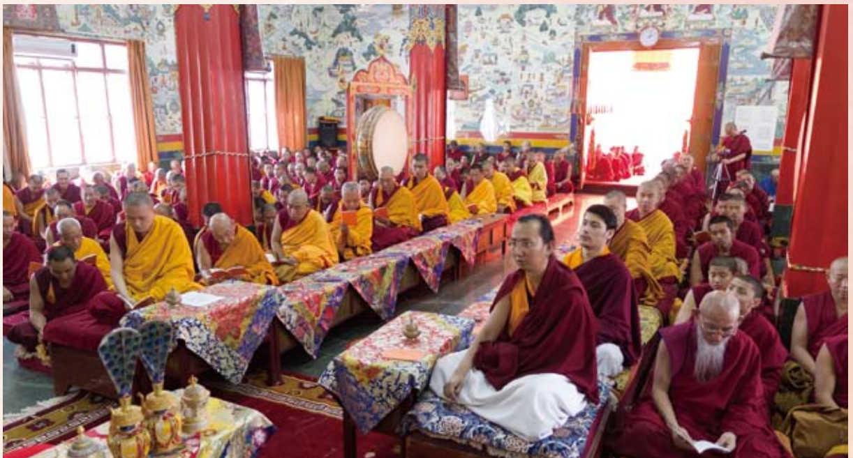
Many high lamas received the initiations