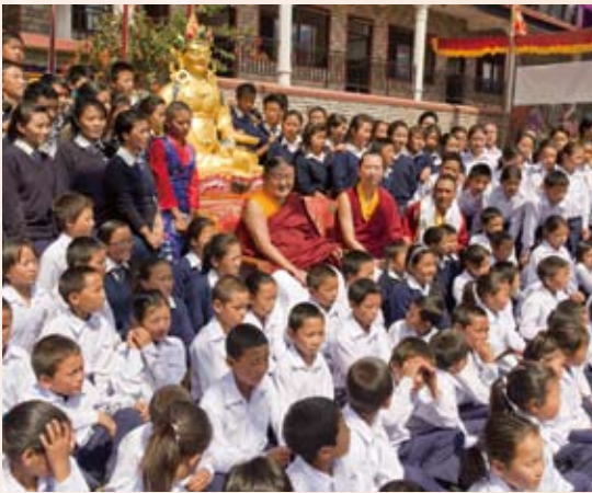
Great Compassion Boarding School

During His stay in Pokhara, His Holiness took the opportunity to visit several schools and institutions.