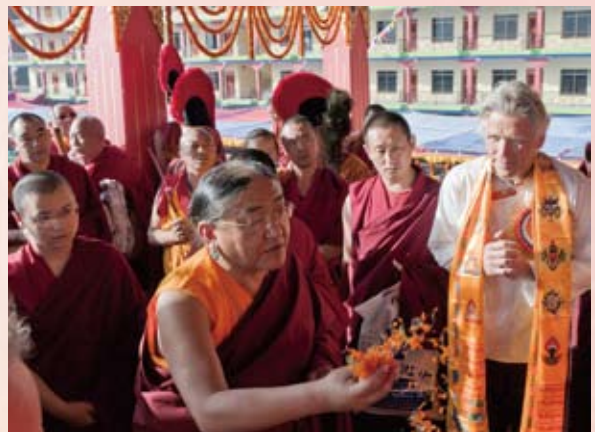
His Holiness blesses the temple doors