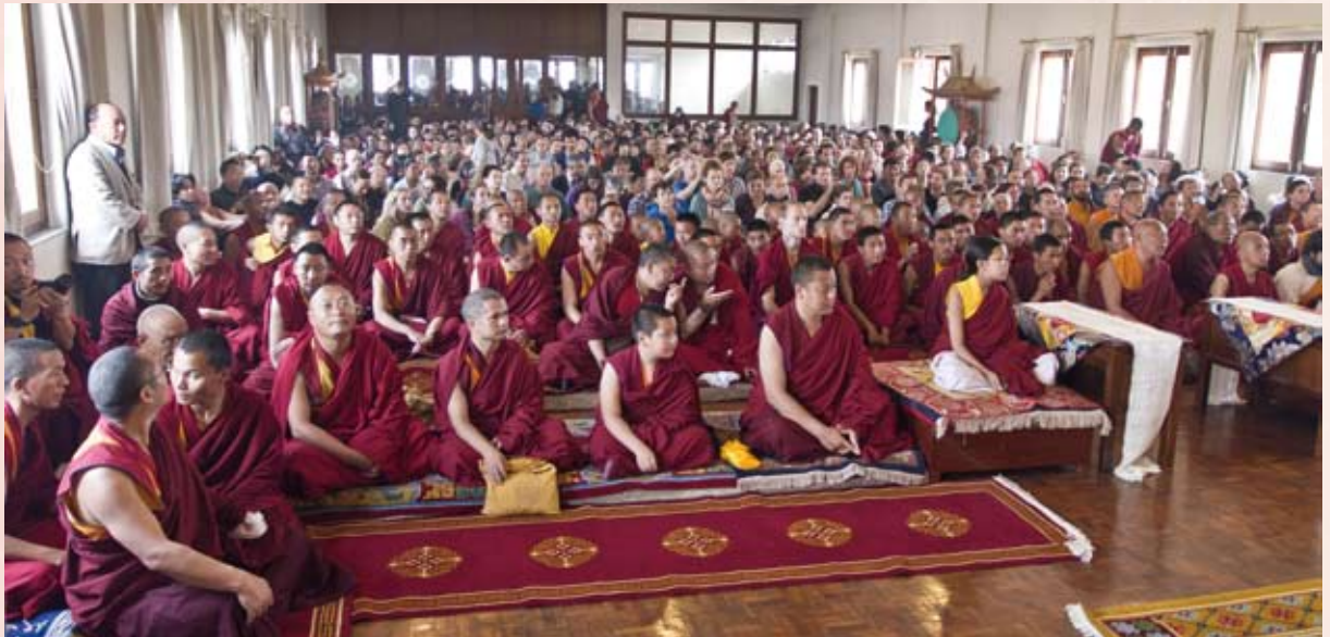
Manjushri Chenang at IBA

His Holiness spent the remainder of His stay in Boudhanath, where His first activity was to bestow the Manjushri chenang to a roomful of monks and students at IBA, followed by a Dharma talk in English on Jetsun Dragpa Gyaltsen's 'Songs of Realisation'.