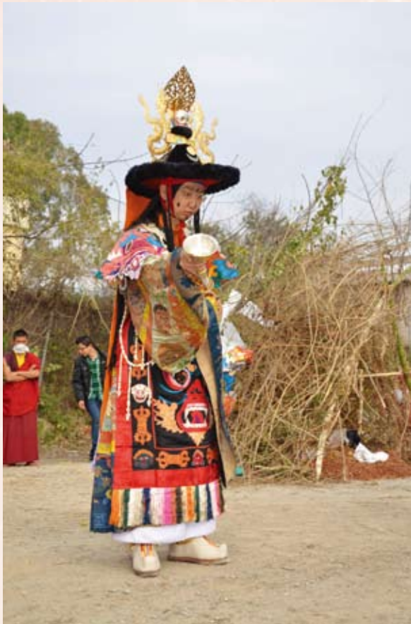
Khöndung Ratna Vajra Rinpoche performing the serkyem offering ritual

depth that is only found within the domain of the very highest masters. Throughout the ceremony, the temple courtyard was imbued with Vajrakilaya's presence, and the rites were a powerful expression of his holy activity.