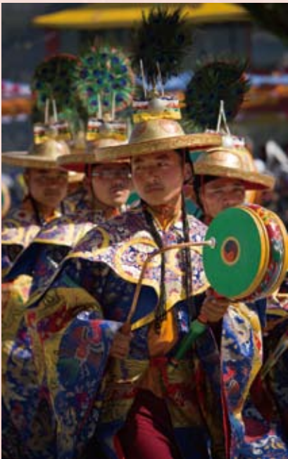
Monks performing the Vajrakilaya ritual dance