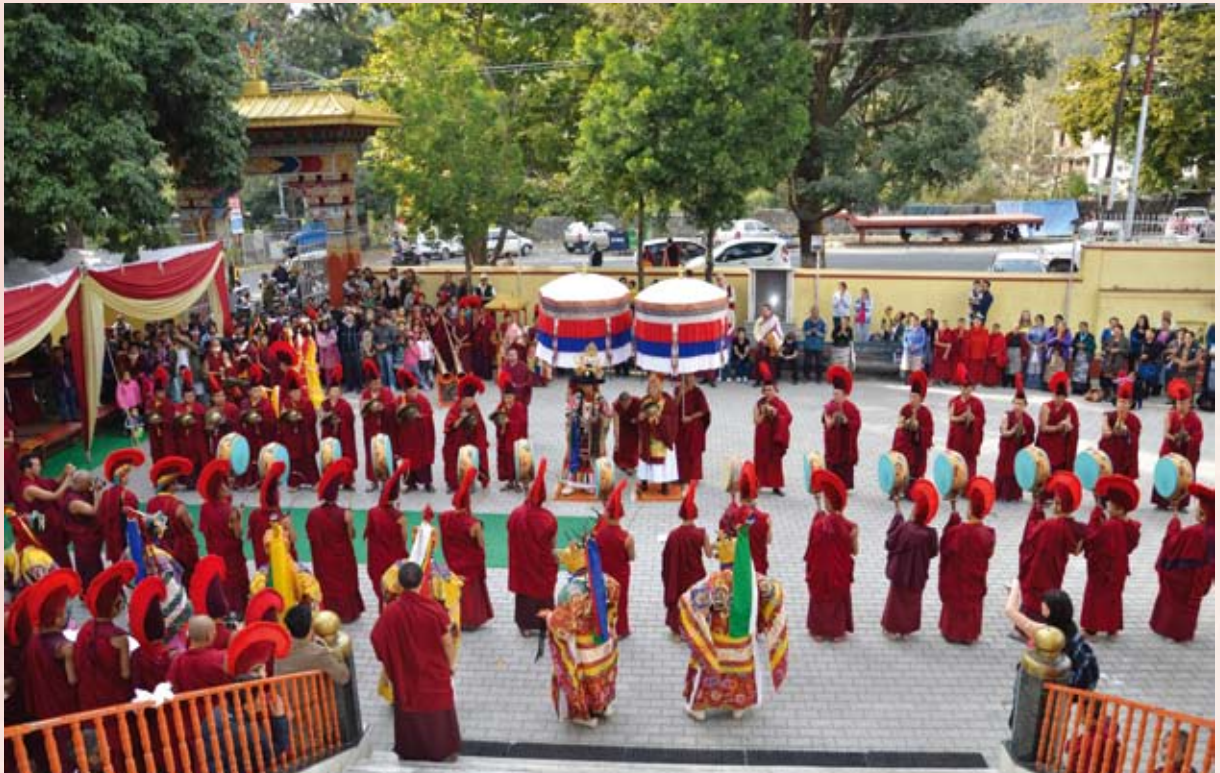
The ceremony is held in the temple courtyard

family, and so the celebration of its ritual acquires an added dimension when it is conducted by a member of the Khön lineage. If last year's celebration of Guttor, led by Khöndung Gyana Vajra Rinpoche, was characterised by intense fervour, this year's was in turn marked by an unfathomable spiritual