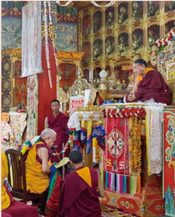
Tenshug for His Holiness