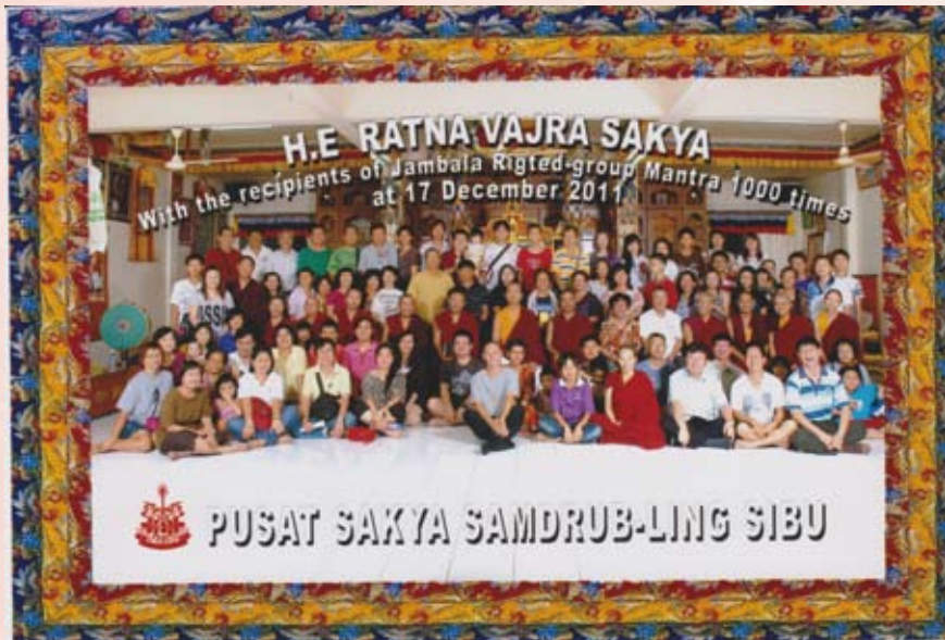
Rinpoche at the 'Wish-Fulfilling Family Day'

empowerments as well as the Jambhala Rigted and Medicine Buddha. Rinpoche performed many more Dharma activities, including group recital of mantras and Fire Pujas with the Sangha, which everyone found highly inspiring.