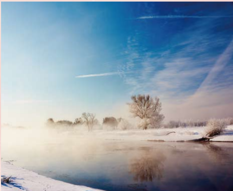
A magical setting