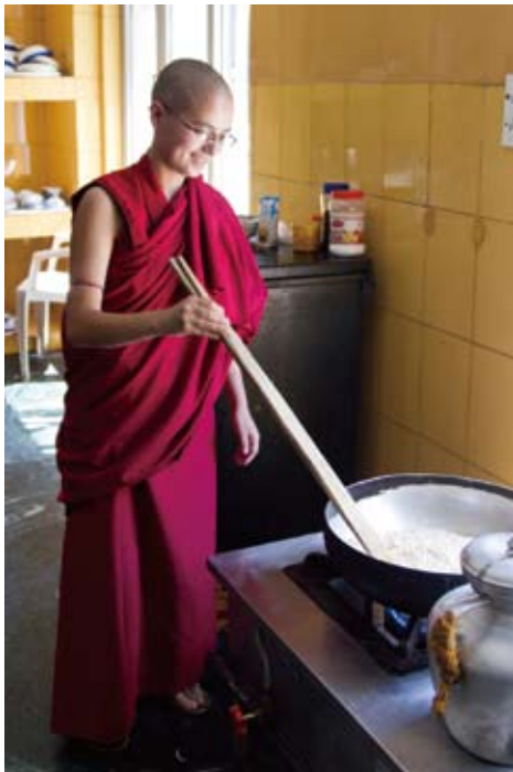
Household duties with a smile

Among the disciplines covered at the Institute are vinaya, abhidharma, logic and madhyamika philosophy. The academic year is divided into two semesters, with a set of gruelling exams at the end of each semester. The nuns can pursue their studies