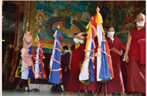
Effigies representing last year's negativities are brought down the temple stairs

The ritual began with effigies representing the past year's negativities being brought down the temple stairs into the courtyard, where a series of purification rituals were carried out by the Vajra Master and his assistants, culminating in the casting of the effigies into a bonfire and, with this, the elimination of all negative influences that could create obstacles to the new year.