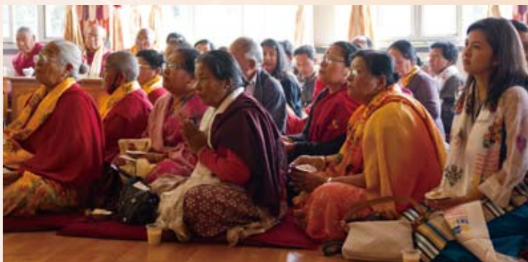
His Holiness at the Triyana Dharma Centre

While in Swayambu, His Holiness took the opportunity to bless different local centres.