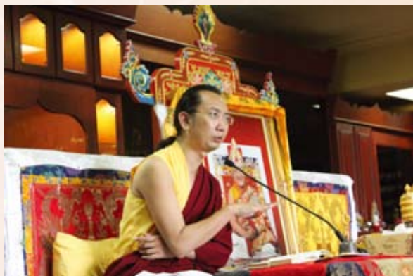
Rinpoche teaching at Sakya Tenphel Ling

Rinpoche's journey in Southeast Asia began with a two-week stay in Singapore, during which time he imparted empowerments and teachings at Sakya Tenphel Ling. These had as their central theme the Sakya view of the non-differentiation of samsara and nirvana, along with daily Dharma practice