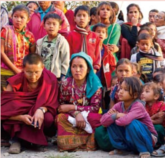
Sakya Orgyen Ling sangha