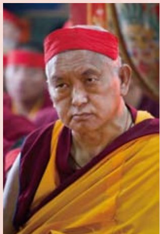
Lama Zopa Rinpoche