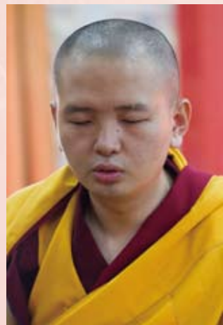
Kunde Ling Rinpoche