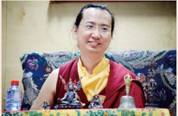
Rinpoche giving a talk at the Otkritiy Mir Centre

Rinpoche began his visit with the bestowal of two lectures at the Otkritiy Mir Centre, the first on 'Parting from the Four Attachments', and another on Jetsün Dragpa Gyaltsen's 'Short Melody of Dream-Like Practices'. The talk attracted large crowds, both sangha members and newcomers.