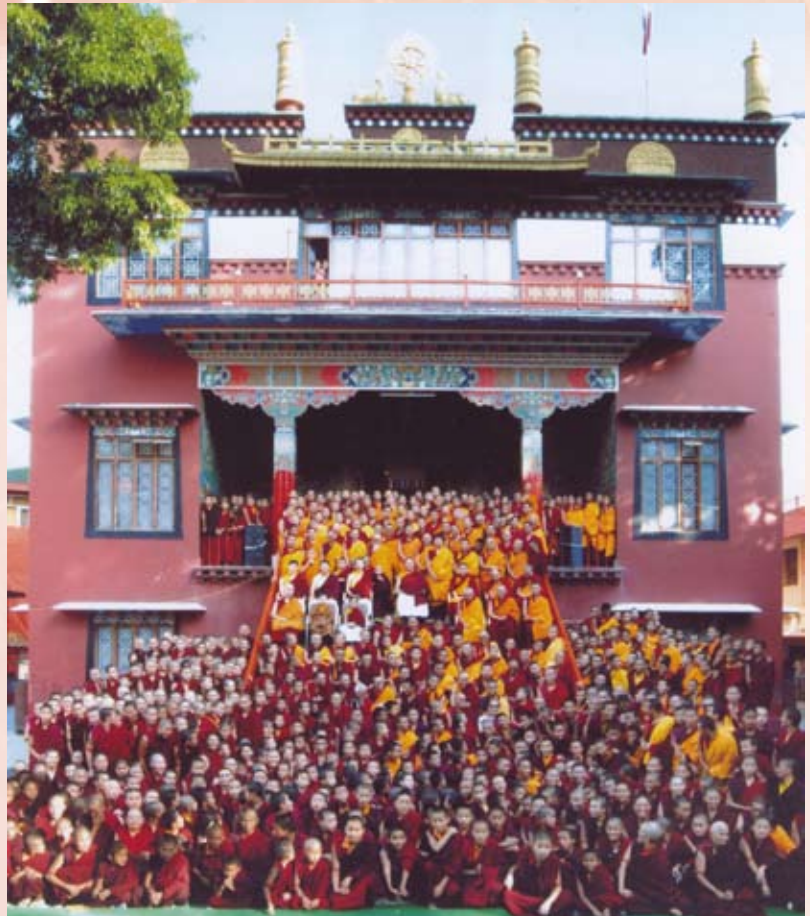
Wangya Norbu Trengwa initiations 2008

And thus the Namgya Norbu Trengwa set of initiations drew to a close, leaving their fount of wisdom in the hearts and minds of all those who were fortunate enough to be present at the Sakya Centre on such a memorable occasion.