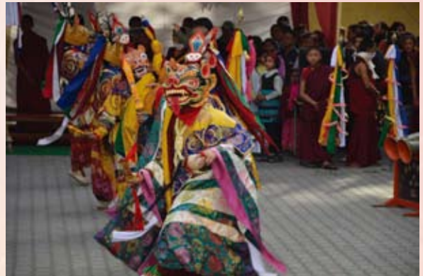
Vajrakilaya's 'attendants' performing a purification dance