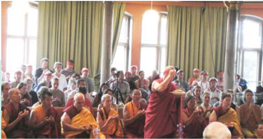
Mandala offering at the Kalacakra wangchen in Stockholm