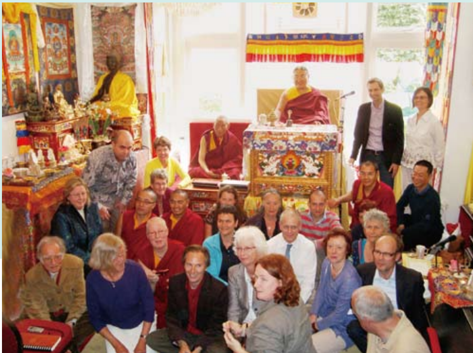
His Holiness and sangha in Sakya Thegchen Ling gomba at The Hague