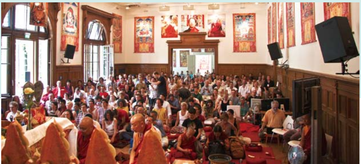
Rigpa-Zentrum, Sogyal Rinpoche's centre in Berlin

On 7 th July, His Holiness travelled to Stockholm, Sweden. There are not many Buddhists in Sweden, and the members of Sakya Changchub Chöling usually meet in a private house. They were overwhelmed