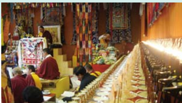
His Holiness performing a Padmasambhava 100,000 Tsok Offering Puja in Rikon, Switzerland

And finally, on Tuesday the 17 th of August, after three months of near ceaseless teaching activity, His Holiness boarded a flight that was to take Him back to India, where He would be reunited with His Family and be able to spend precious time with His grandchildren.