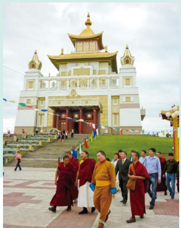
His Holiness, monks and followers at Buddha Shakyamuni Temple in Elista

The temple was filled with devotees as His Holiness imparted teachings and initiations, including a Vajrayogini blessing. He was earnestly beckoned to visit Kalmyk again soon.