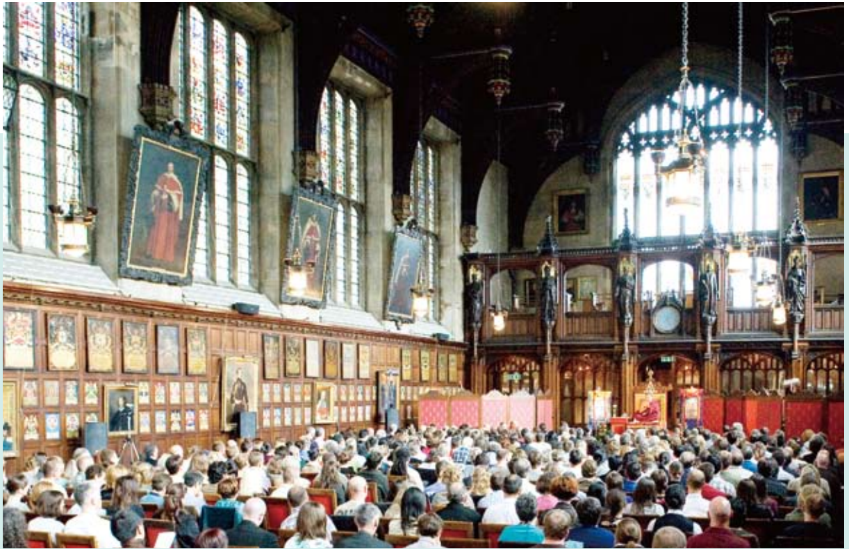
His Holiness teaching at the Great Hall of the Lincoln's Inn, London