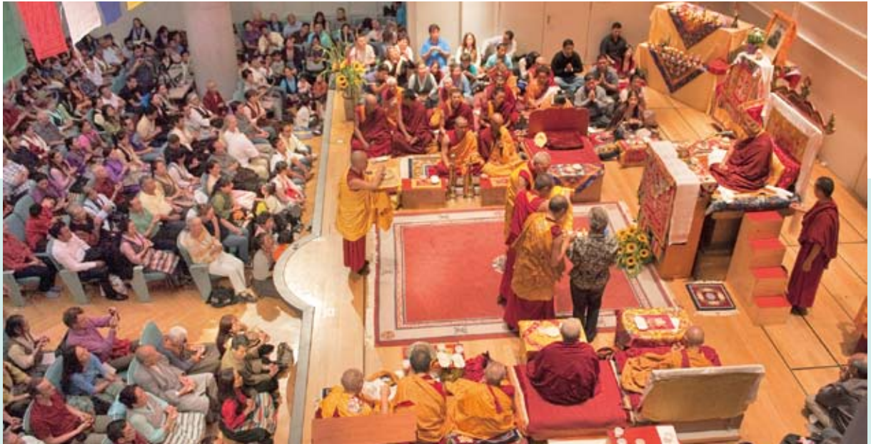
A mandala offering being presented to His Holiness at Rikon