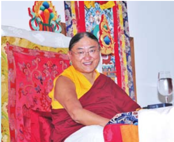
A radiant smile from His Holiness