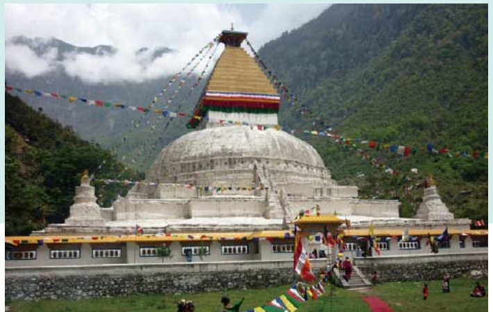
↑ Gorsam Chorten