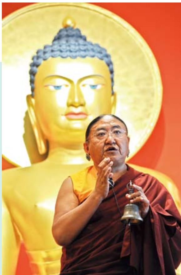
His Holiness at Rigpa-Zentrum, Berlin

His Holiness then spent three days at the Rigpa-Zentrum in Berlin, where He was greeted on 3 rd July with a traditional and warm welcome by keen students awaiting Him in the centre courtyard. That evening, His Holiness gave a teaching on 'The Six Paramitas' to