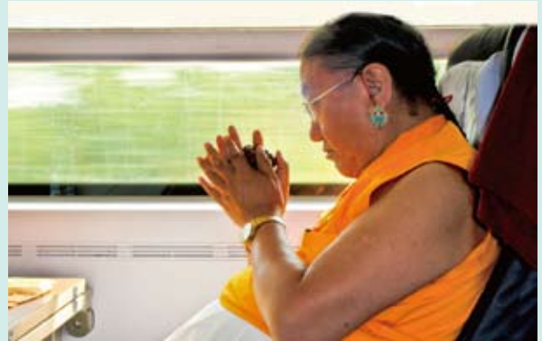
A moment of calm for His Holiness

That evening, His Holiness gave a public talk on the importance of spiritual progress and how to integrate it into everyday life.