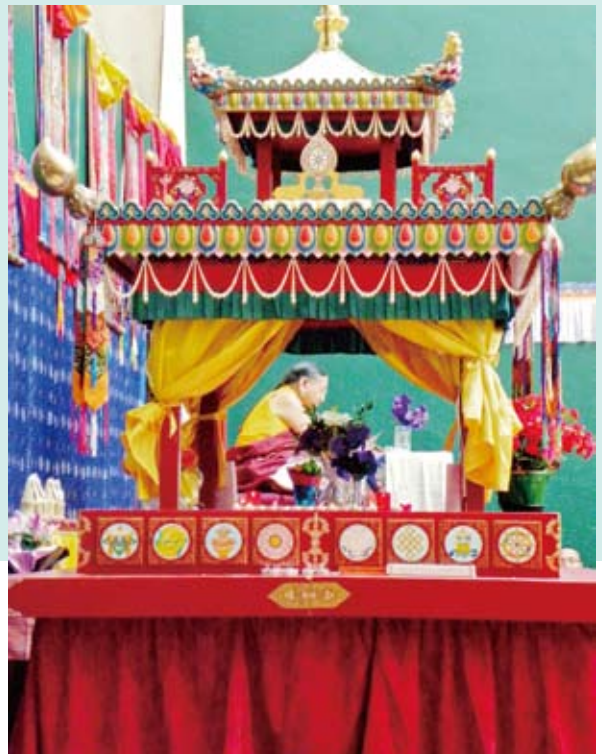
The Kalacakra Mandala House in Biarritz

a gompa was astonishing. The shrine was magnificent, the mandala house breathtaking, and the beauty of the