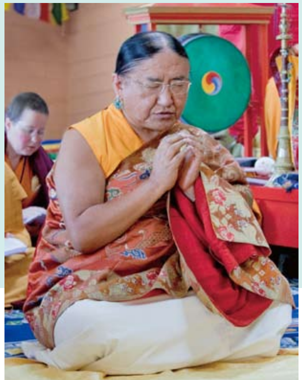
His Holiness leading the Bodhisattva Vows ceremony