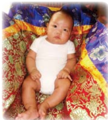
Dungsey Akasha Rinpoche