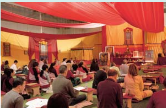
Dorset Cricket Centre transformed into a stunning gompa

On 11 th June, His Holiness travelled to London, where He was to spend the following week. On the afternoon of His arrival, His Holiness was invited by the Tibet Foundation to give a lecture at the SOAS (School of Oriental and African Studies) on “Consciousness from a Tibetan Buddhist Perspective”. That evening, His Holiness was guest speaker at the celebration of the 25 th Anniversary of Tibet Foundation.