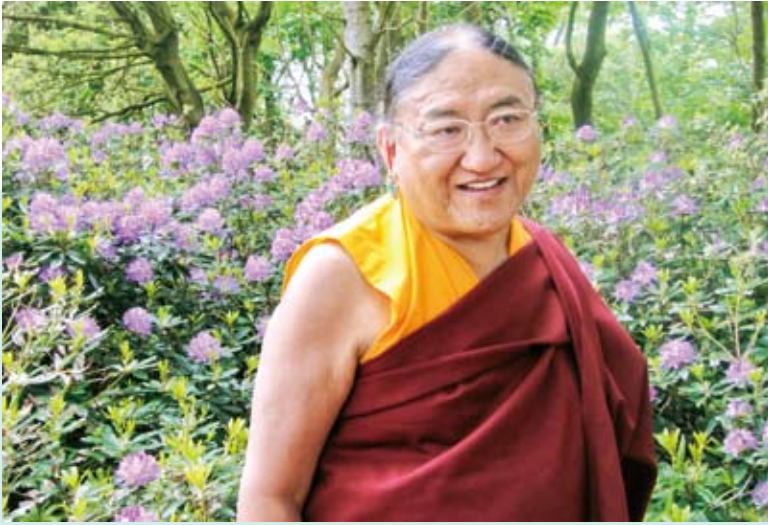
His Holiness enjoying the woods at Deer Park

‘The greatest blessing of my life has been to receive these teachings and empowerments from His Holiness Sakya Trizin. Being with him for an intense four days is akin to having your entire being blown apart, re-wired, and left to settle, and when it