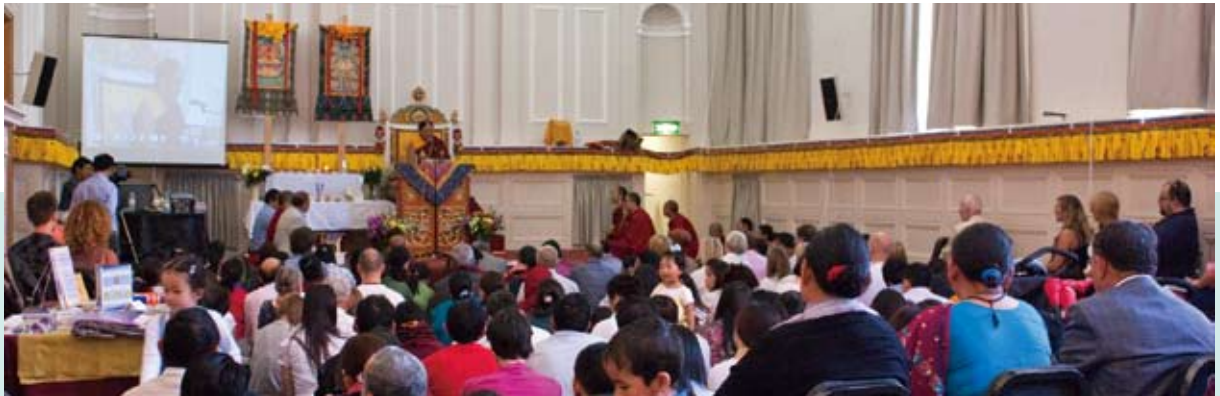
His Holiness teaching the Amitabha Powa in Reading

Immediately following His Holiness' visit, a new Sakya dharma center was opened in Moscow, and we pray that it will grow stronger and stronger; we pray that the Sakya teachings will spread widely in Russia, that many Sakya lamas will visit us in the future, and that the disciples of this center will greatly benefit all sentient beings. Sarwa Mangalam!