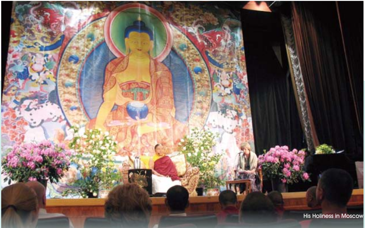
His Holiness in Moscow