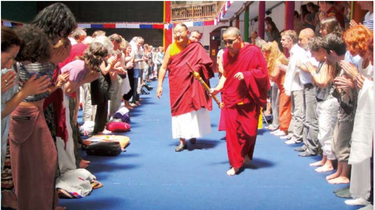
His Holiness arriving at the hall