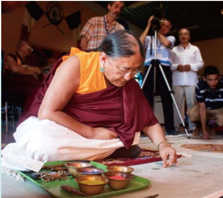
His Holiness initiating the sand mandala