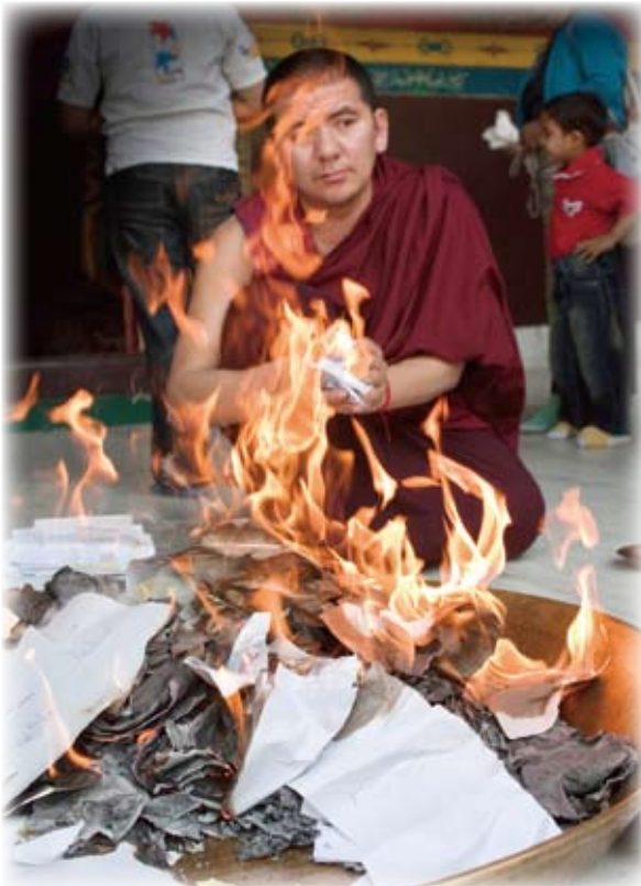
Mahavairocana ritual of purification: lists of names of the deceased are put into the flames

Saravidhia is a very powerful puja and initiation. It is particularly powerful in purifying karma that causes to be born in the lower realms. We usually perform this puja for the deceased. But it is also very beneficial for people who are gravely ill, as it either speeds up their recovery process, or grants them a quick death, saving them from extended suffering.