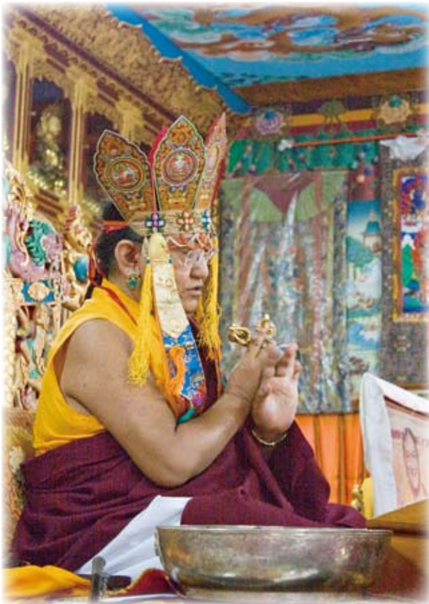
His Holiness officiating at a Mahavairocana puja in Sakya Centre earlier this year

Mahavairocana is one of the most important pujas in Tibetan Buddhism. In Tibetan, it is called ‘Khünrig’, and in Sanskrit ‘Saravidhia’. Originally, it was a tantra given in the heavenly realms.