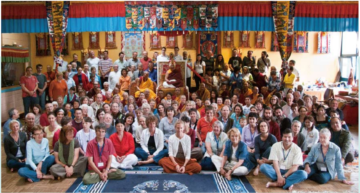
Group photo on the last day of the teachings